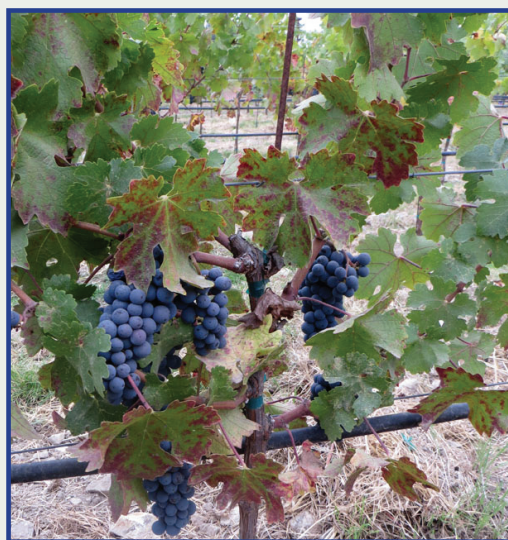
Red blotch in Cabernet franc.