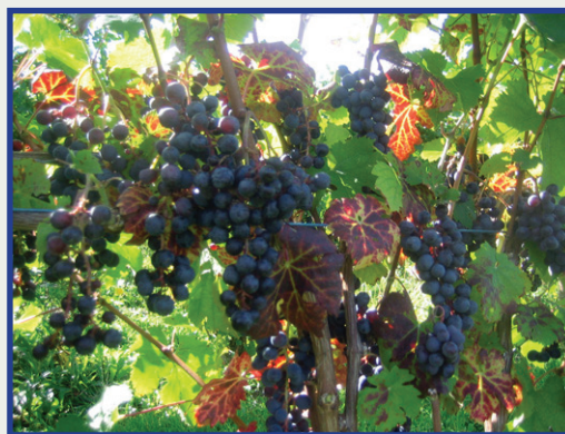
Leafroll in Cabernet franc.